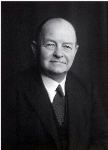
Lord George Hall