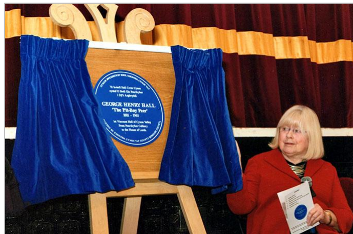
Ann Clwyd, M.P., unveiling the plaque