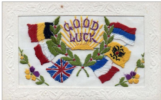
An embroidered greetings card