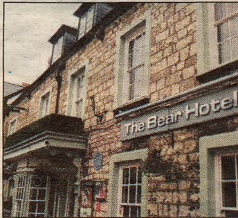
The Bear Hotel in Cowbridge

"Hopefully we'll sit here at this very table. I'll call her Lizzy. I'll