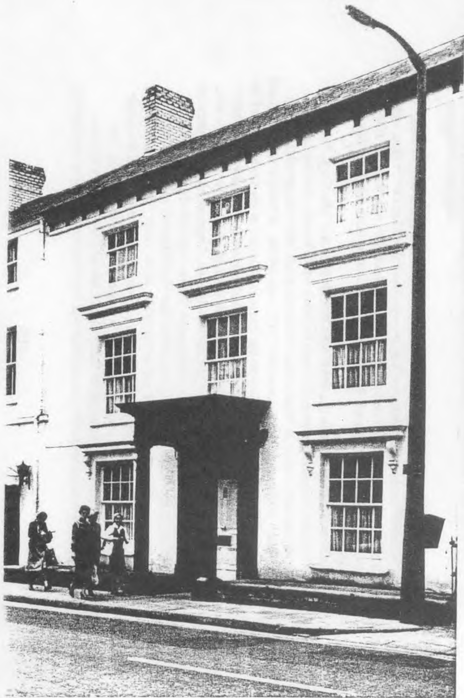
14. Caecady House, once the town house of the squires of Caecady, Welsh St. Donat's