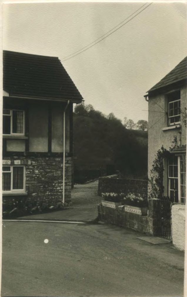
① FRONT ELEVATION OF 'OLD TOWN MILL'

THE CHARACTER OF THIS 'GROUP' WOULD BE DIMINISHED IF ADJACENT DEVELOPMENT WERE PERMITTED.