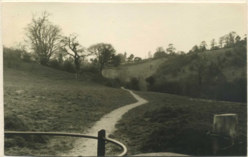
② VIEW FROM CONSTITUTION HILL SHOWING FOOTPATH

THIS IS A SUPERB PIECE OF LANDSCAPE WHICH REALLY 'TEMPTS' THE WALKER TO EXPLORE IT. IT EVENTUALLY BRINGS ONE INTO THE PLEASANTLY CONSERVED PART OF OLD LLANBLETHIAN. J.P. Morgan.