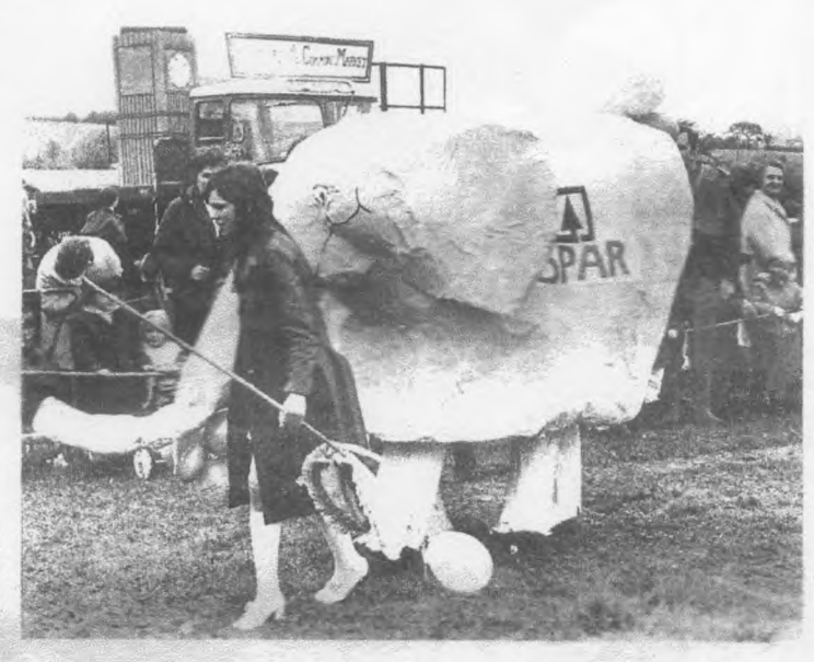
By far the most popular event was the Cowbridge Carnival and this exhibit was one of many which attracted the judges' notice and a prize no less.