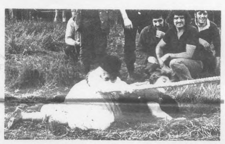
... the best laid plans of mice and men often ... the mice were missing, but the ladies all but landed in the drink