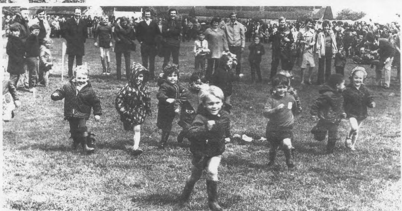
Carnival Day would not be the same without the races and the spirit of determination can be detected on the faces of these children, closely watched by proud parents.