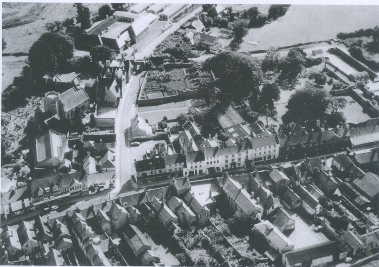
Cowbridge town centre in the 1960s: photo from the Local History Studies Room

My background as geographer and an historian tells me that, of course, towns - even historic towns like Cowbridge - must change and adapt to the future. There are plenty of examples of how that took place in the past - the growth and changes in the 18 th century, the opening of the by-pass in the 1960s and the building of new estates in the 1970s - are evidence of what can be accommodated. But these new proposals