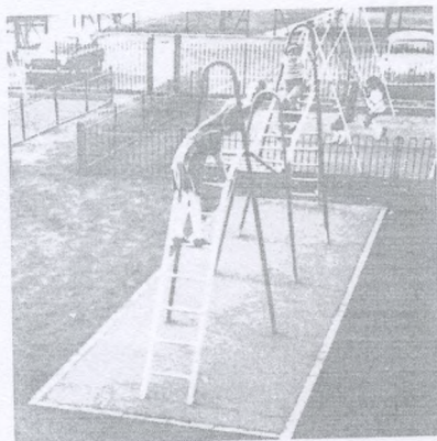
One for just playing around.

Polysport is designed for more general use, as a safely surface in