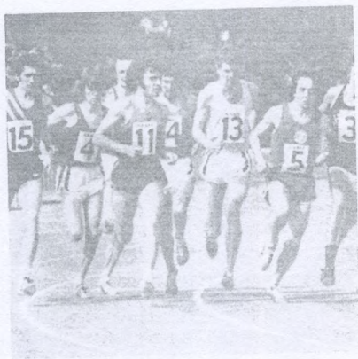
One for serious athletics.

Although we're relative newcomers to the field of synthetic sports and recreational surfaces, we're certainly no strangers to the world of polymer technology.