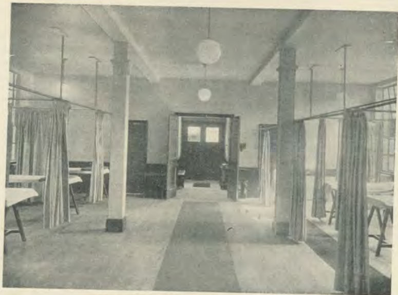
OUTPATIENT DEPARTMENT AT CARDIFF.

The control of the intricate work done by the Hospital is allocated, under a scheme approved by Charity Commission, to four Committees: Executive, House, School Management, and Medical Board. The Hospital is recognised by the Welsh National Medical School for the Teaching of Orthopædics, and is the only Hospital in South Wales and Monmouthshire devoted solely to Orthopædics.