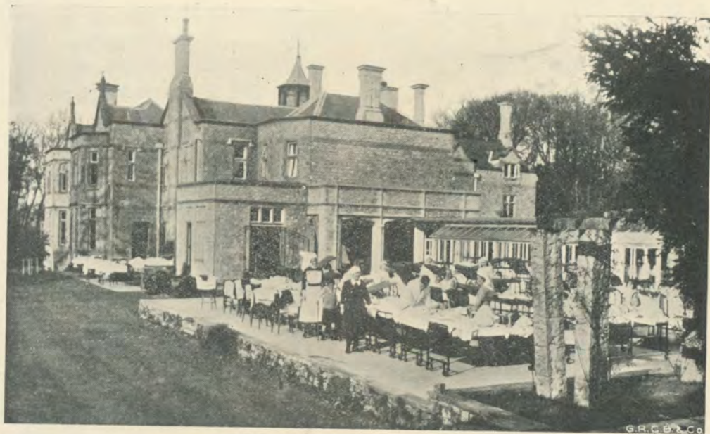
CROSSWAYS COUNTRY BRANCH.