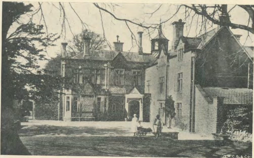
CROSSWAYS COUNTRY BRANCH.