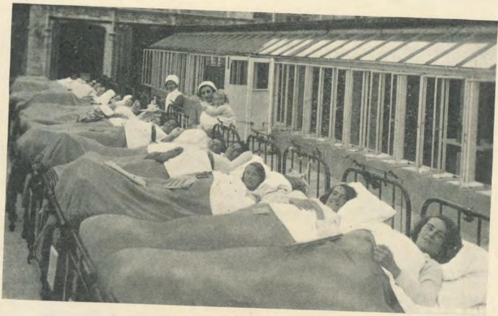
SOME OF THE PATIENTS AT CROSSWAYS.