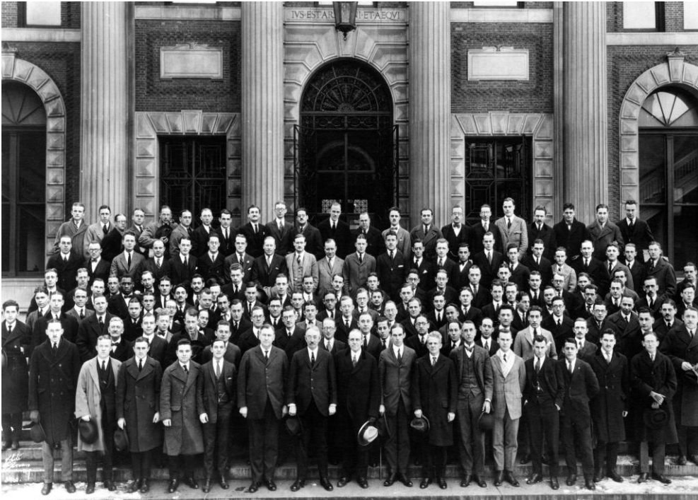
Columbia Law School graduation class, 1923