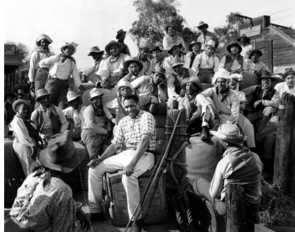
Cast of Showboat, 1928

The rise and influence of cinema on audiences worldwide offered an opportunity for Paul Robeson to blend his politics with his artistic talents. It provided a chance to connect with a rapidly growing film audience.