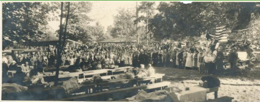
1930 Seattle Welsh Picnic Woodland Park

We look forward to seeing you there for great food, heartwarming singing, and a good time!