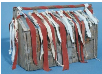
19th century Pembrokeshire Wren House

Sadly, the custom of the Wren boys is no longer practiced in Wales, but I am including it because it is still done in the south of Ireland with some differences. In Wales on January 6th, men would capture a wren, cage it, and then carry it door to door collecting money or soliciting food and drink. [Editor's Note: Here are links to read more about the Hunting of the Wren Hela'r Dryw tradition in Wales https://torstone.org/pagan-life/welsh-winter-traditions-part-ii and https://trac.cymru/en/hunting-the-wren/ ]